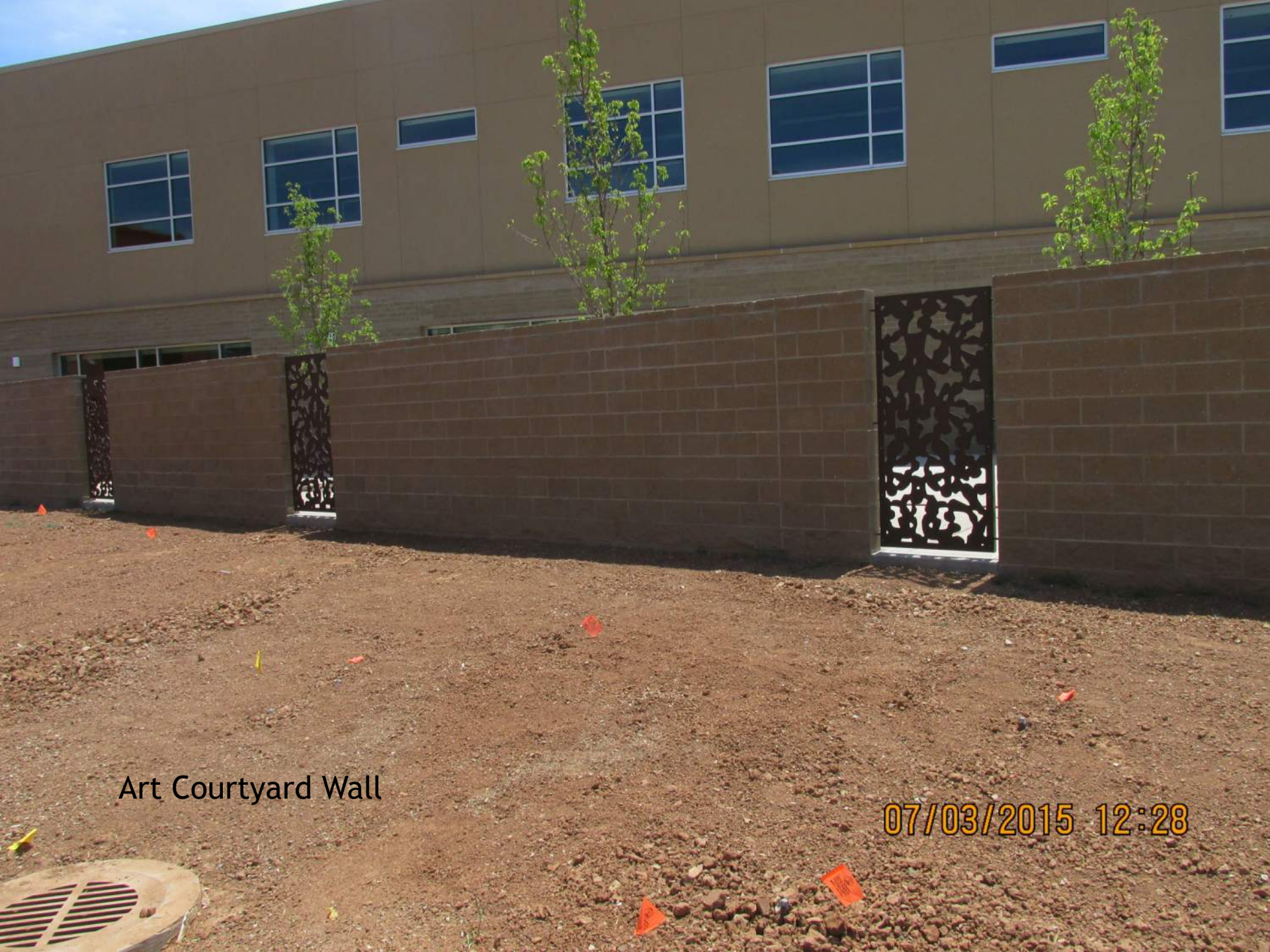
Art Courtyard Wall