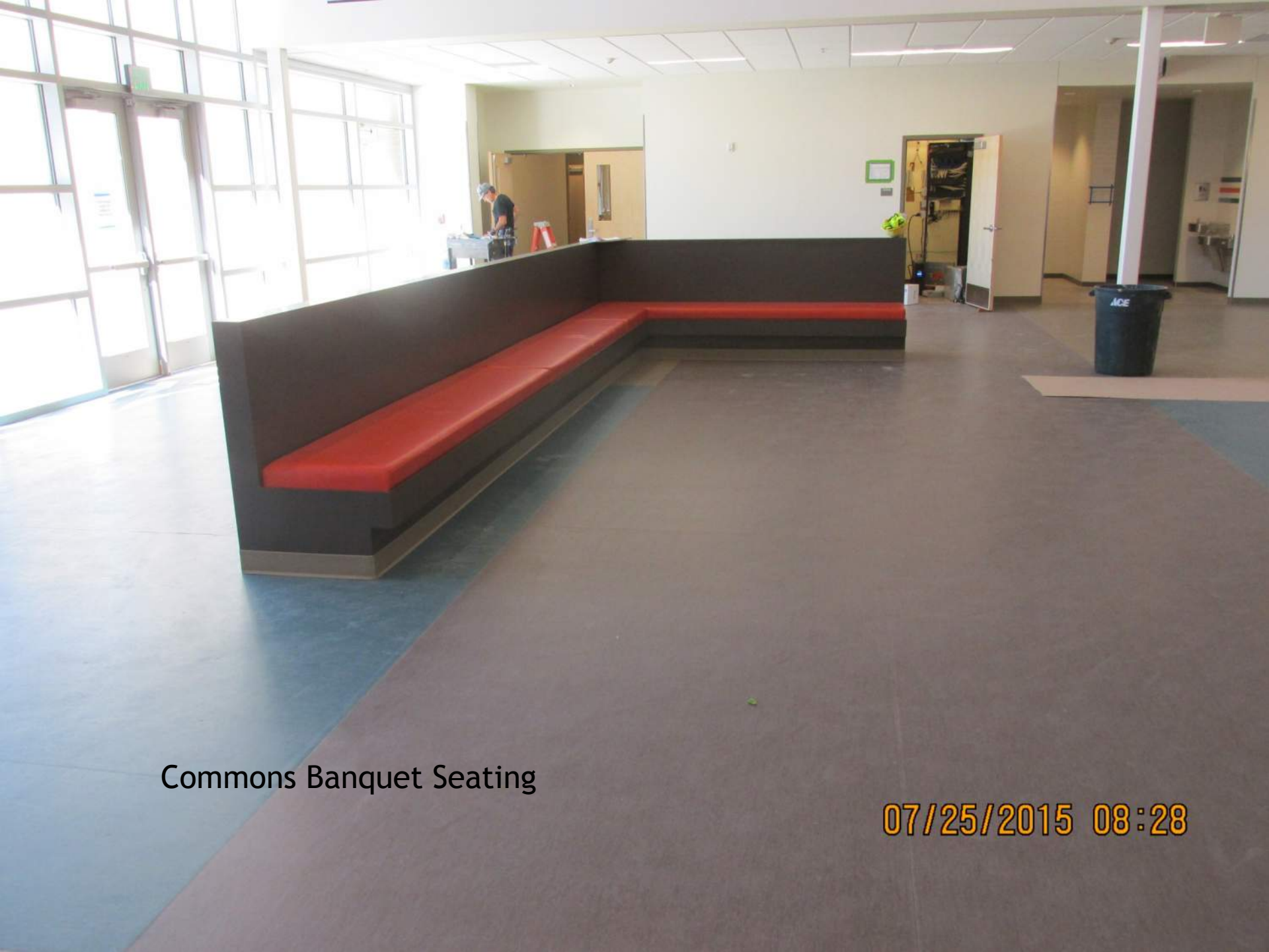
Commons Banquet Seating