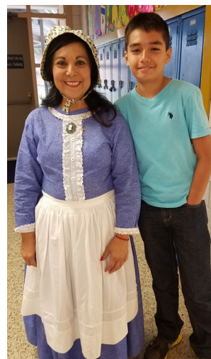
"I'm Loco for Trash"

A Texas-sized "thank you!" goes to the middle school students and teachers that participated in the second Don't mess with Texas Can Slogan Contest! They received more than 600 entries from middle school and high school students!