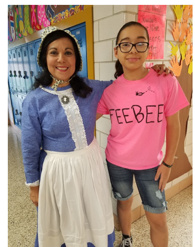
"Feed Me Till I'm Full"