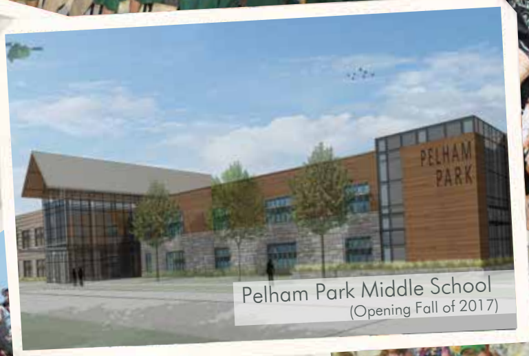
Pelham Park Middle School (Opening Fall of 2017)