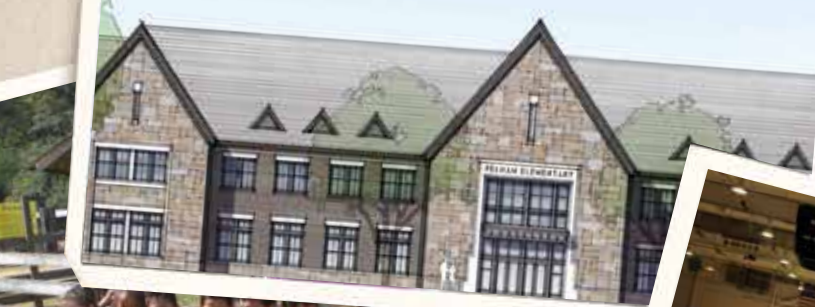
Pelham Ridge Elementary School (Opening Fall of 2016)