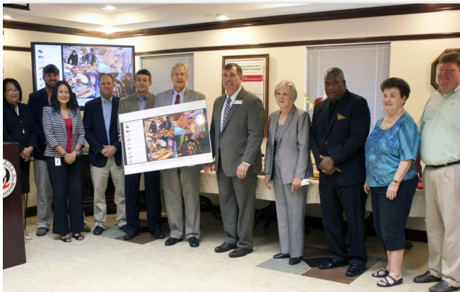
Members of CB&T of East Alabama/Synovus receive token of appreciation from FOPCS.