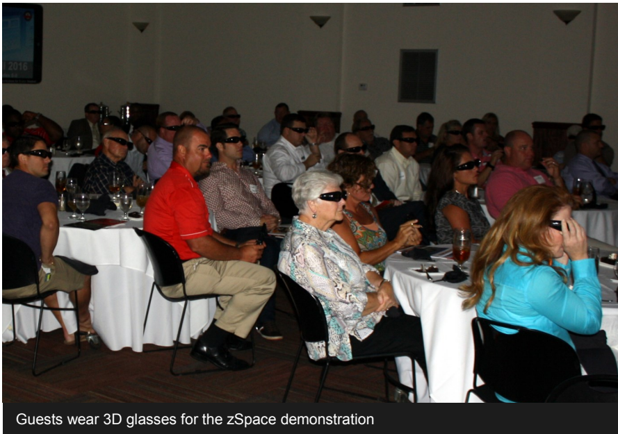
Guests wear 3D glasses for the zSpace demonstration

“If you want to grow a community, if you want to improve the quality of life, if you want to improve the economy, start with education .”