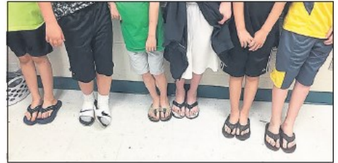
On Friday, these flip flop wearers were ready to flip for the end of the year.