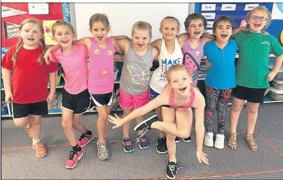
First-graders dressed in workout wear for "Get Your Brain in Shape" last Thursday.