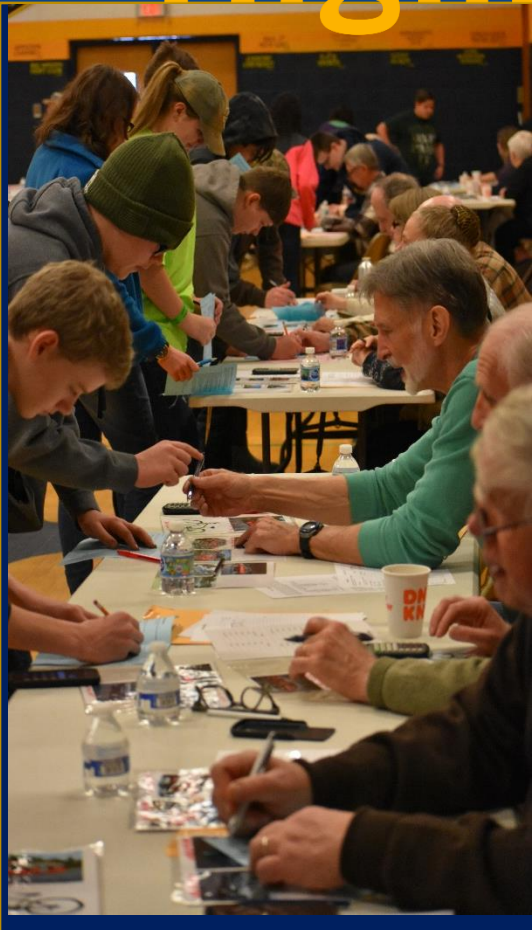
8 TH Grade Reality Store Event

The 8th grade students experienced the annual Reality Store event on February 27th at RCHS. The Reality Store, provided by the Virginia Cooperative Extension, is a financial management program that brings awareness to the value of a dollar when factoring in the cost of daily living. Each student was randomly assigned a monthly net salary, career, and marital/family status. Then they were instructed to visit all of the booths that were set up around the gymnasium which were run by community volunteers. Each booth represented common, “real life” expenses: childcare, transportation, grocery, housing, etc. The students, whom were responsible for staying within their budget, learned how to make smart financial choices through organization, goal setting, awareness of finances, and developing a plan.