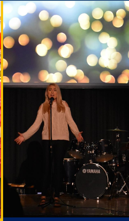
PRIDE Variety Show

RCES students participated in Read Across America Week on March 4 th - 8 th . Based off of Read Across America Day, March 2, this week celebrates the magic of reading by honoring the birthday of the late Dr. Seuss. Students participated in a spirit week with each day representing a theme from one of Dr. Seuss’ books. In addition, special reading activities were held. Classrooms were visited by special guests from the central office, the community, and even students from higher grade levels who shared in the special story time. The week ended with “Flashlight Friday.” The lights in each classroom were turned off and the teachers read to the students using a flashlight. In addition, teachers had the option of competing in a door decoration contest. This week both inspired and promoted the enjoyment of reading books.