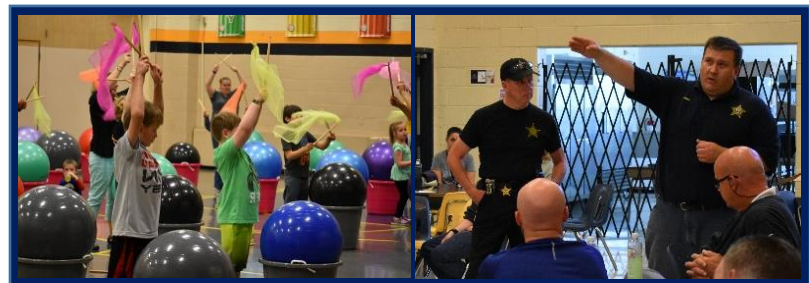
Photos from previous Drums Alive Kids Beats event and ALICE trainings.

Plus- Spaghetti Dinner (5pm) & Drums Alive Kids Beats Event (6-8pm). See our website for more details.