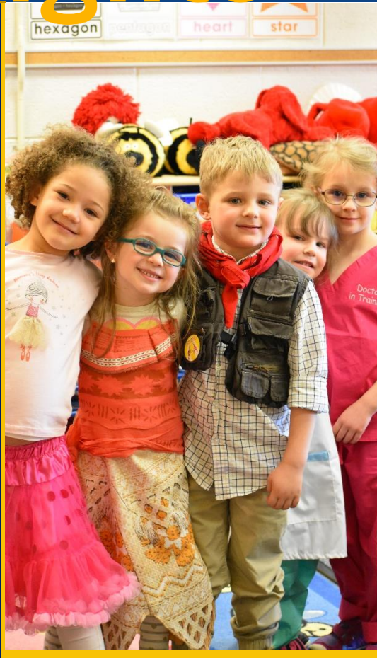
Read Across America Week

The 8th grade students experienced the annual Reality Store event on February 27th at RCHS. The Reality Store, provided by the Virginia Cooperative Extension, is a financial management program that brings awareness to the value of a dollar when factoring in the cost of daily living. Each student was randomly assigned a monthly net salary, career, and marital/family status. Then they were instructed to visit all of the booths that were set up around the gymnasium which were run by community volunteers. Each booth represented common, “real life” expenses: childcare, transportation, grocery, housing, etc. The students, whom were responsible for staying within their budget, learned how to make smart financial choices through organization, goal setting, awareness of finances, and developing a plan.