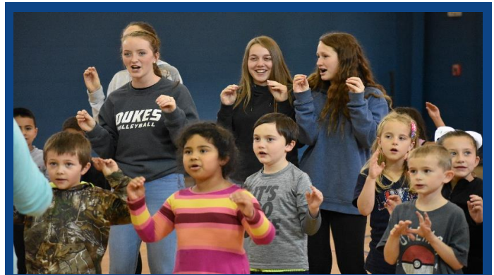
RCHS Peer Mentors bonding with RCES students