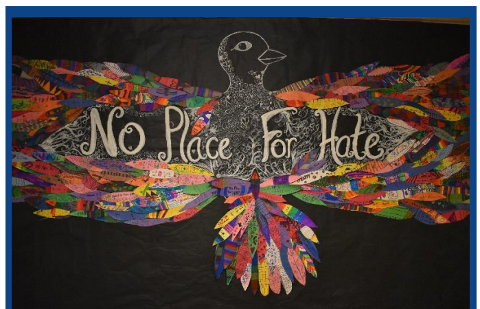
RCES mural "No Place for Hate"