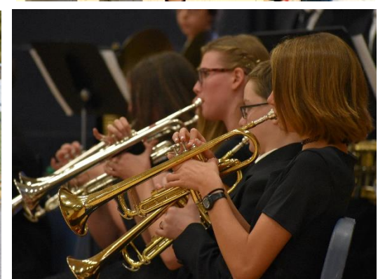
Top row (left to right) -1. Scholastic Bowl at UVA. 2. Farm to School Week 3. Homecoming Pep Rally Middle row (left to right) -1. Homecoming King and Queen 2. Nature walk with RappFLOW. Farm to School Art Contest Prizes Bottom row (left to right) -1. Watershed activity by RappFLOW and Friends of Rappahannock 2. Competition Cheer send-off to States 3. RCHS Concert Band at the Veterans Day Program