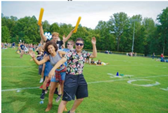
Students and staff creating the human rollercoaster to celebrate PRIDE