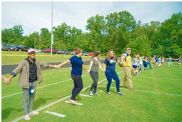
RCBS students and staff create a human chain in unity