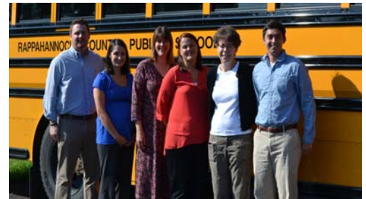
RCPS Welcomes New Staff Members:

RCPS Vision Statement: To empower every student to reach his or her full potential.