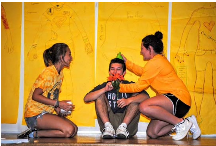
RCCHS students involved in mentor “boot camp” activities