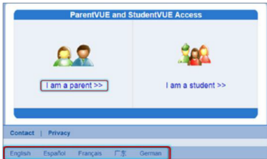
Figure 1-1 ParentVUE and StudentVUE Access Screen