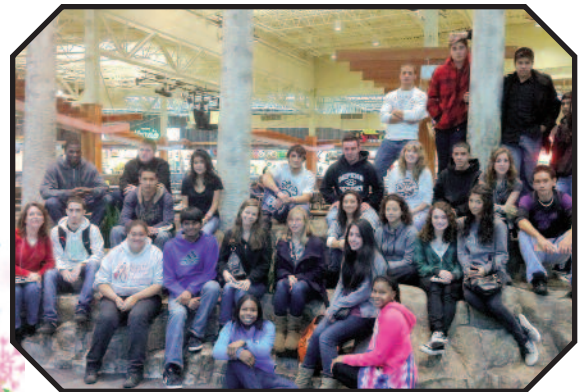
RPMS students took a field trip to the Jersey Gardens Mall where they were given a presentation and tour by the Mall's Marketing Director. The trip was entitled, "The Retail Experience. (See photo above).