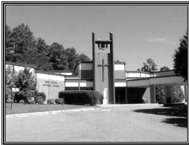
A Jewel in the Diocese