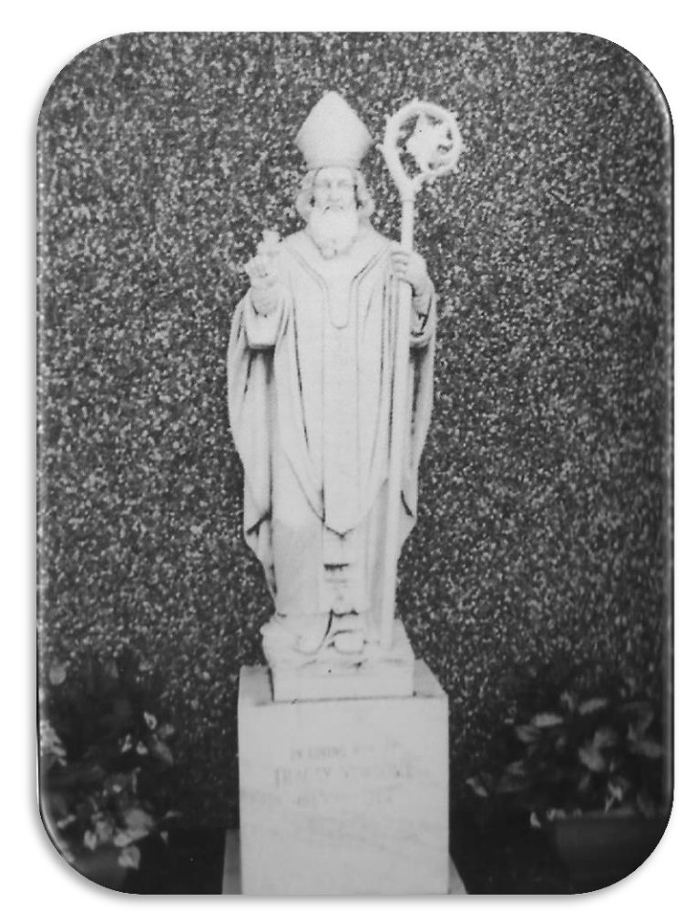
Celebration of the Holy Sacrifice of the Mass