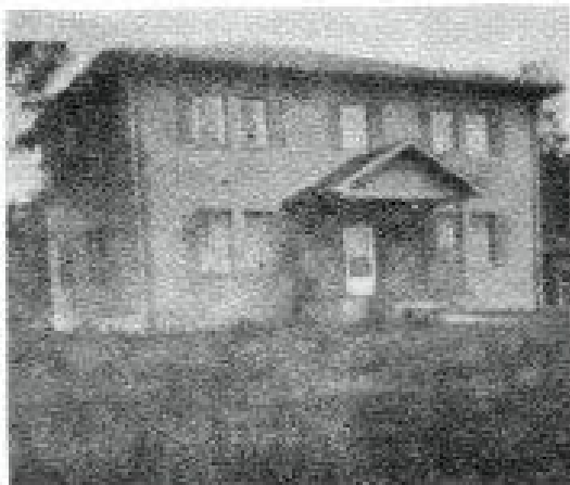
The Rectory - 1972