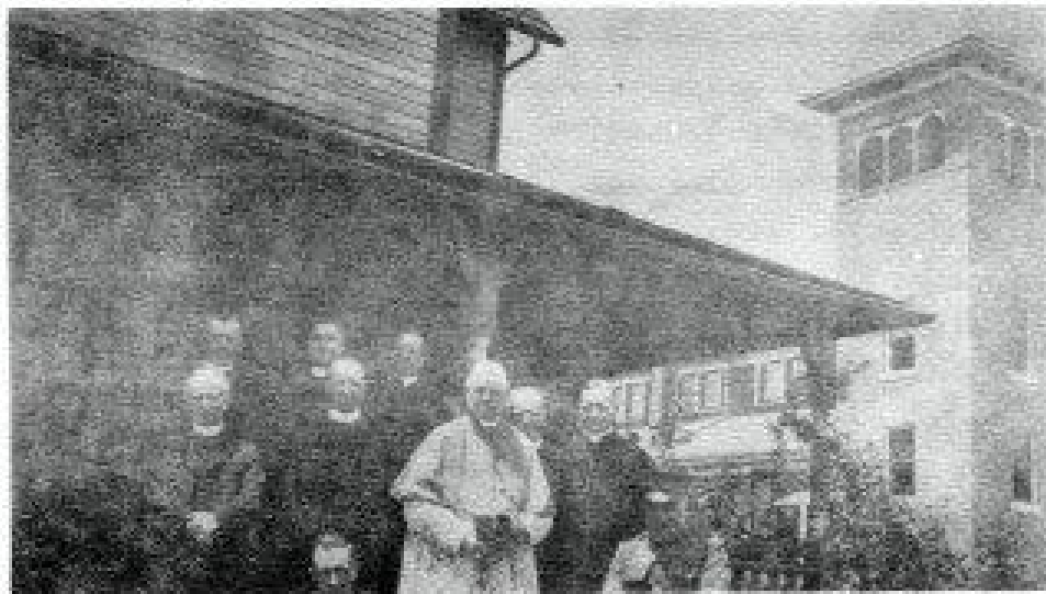
Participants on the porch of the rectory