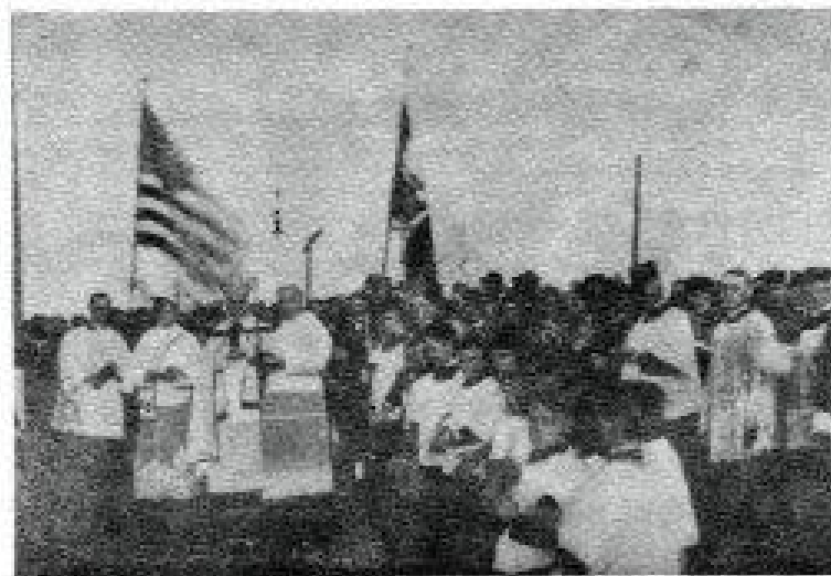
Parishoners and clergy in front of the church