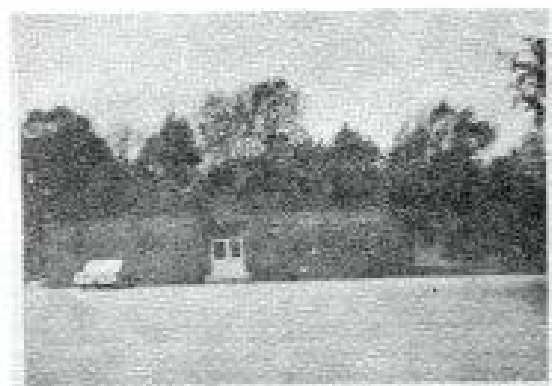
The School built in 1960