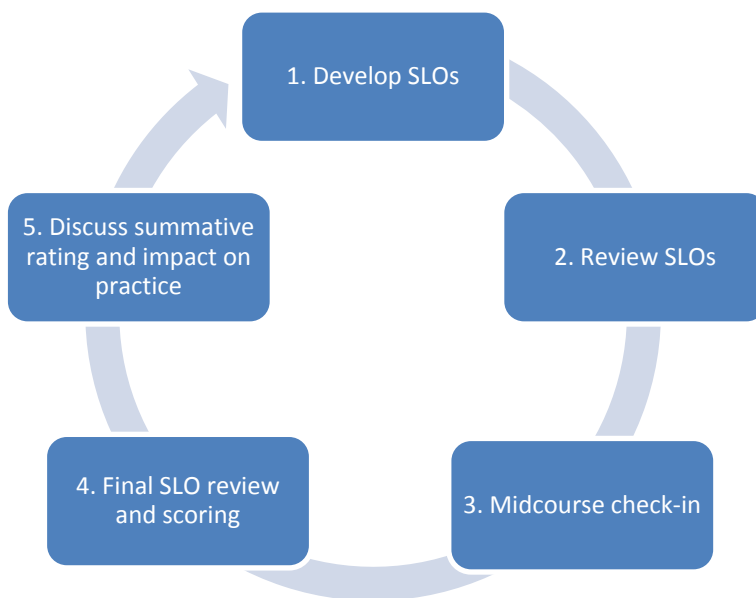
Figure 3. A Typical SLO Cycle

Evaluators participate in this process by lending support to teachers who are developing SLOs by reviewing and approving SLOs. The evaluator reviews SLOs created by a teacher using a checklist developed by the Joint Committee (for an example, see Appendix H: Sample SLO Template Checklist and Review Documentation ) and provides constructive feedback and suggested changes to ensure that the teacher’s SLO is both rigorous and attainable. Throughout the evaluation cycle, the evaluator should collaborate with the teacher to ensure that students are on track to meet the growth target. At the conclusion of the evaluation cycle, the evaluator uses a standardized process to score the teacher’s outcomes in meeting the SLO growth targets and combines the SLO outcomes with other evaluation measures to create a summative score. Most importantly, the evaluator provides the teacher with feedback to inform improvements in practice, identify relevant professional development, and set SLOs for the next evaluation cycle.