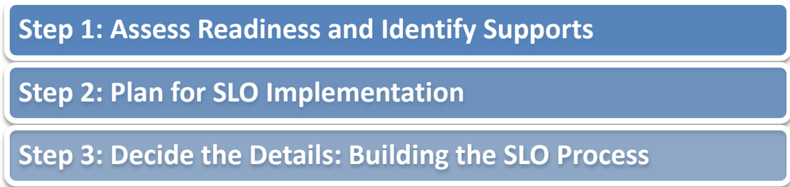
Figure 1. Overview of Steps for Developing an SLO Process

Implementing an SLO process across a school district requires careful planning and thoughtful execution by district staff. Joint committees play a critical role in ensuring that a rigorous SLO process is aligned with other district initiatives, is integrated into teachers' instructional practices, and lessens the paperwork and the time burden on teachers and evaluators as much as possible. This section provides a road map with step-by-step suggestions for Joint Committees to use when considering and planning for an SLO process. It begins with a high-level overview of the steps in developing an SLO process (Figure 1). Next, each step is discussed in more detail, including explanations, guiding questions, and links to resources to support Joint Committees as they work through each step.