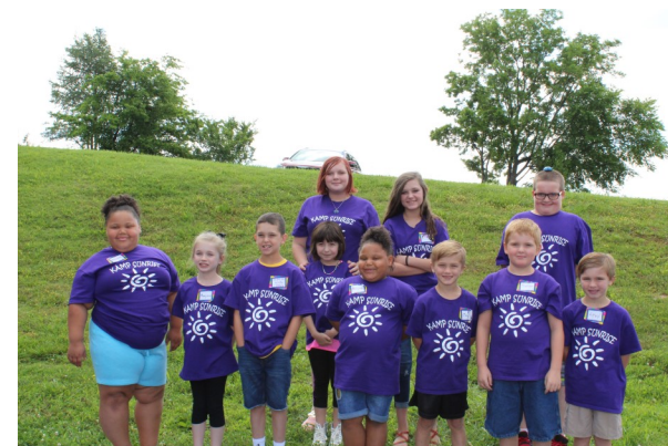
Kamp Sunrise 2017