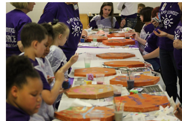
Expressive Art Activities