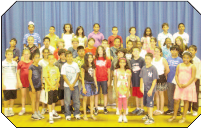
Above: EJF-Aldene fifth grade students pose one last time together at the annual awards ceremony.