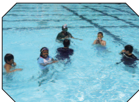
Above: EJJF-Aldene students having fun at their fifth grade luncheon held at the Cranford Pool.