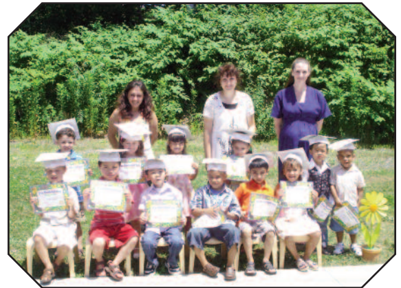
Above: Pre-K P.M. students show their promotion certificates.