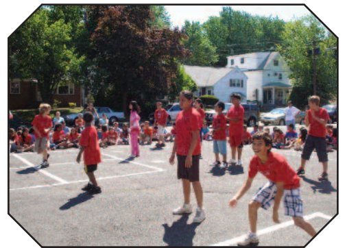
Above: EJJF-Aldene fifth graders finally beat the teachers for the first time ever in the elementary school's annual volleyball game.