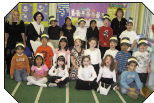
Above: RG first graders celebrated Thanksgiving as Pilgrims and Indians.